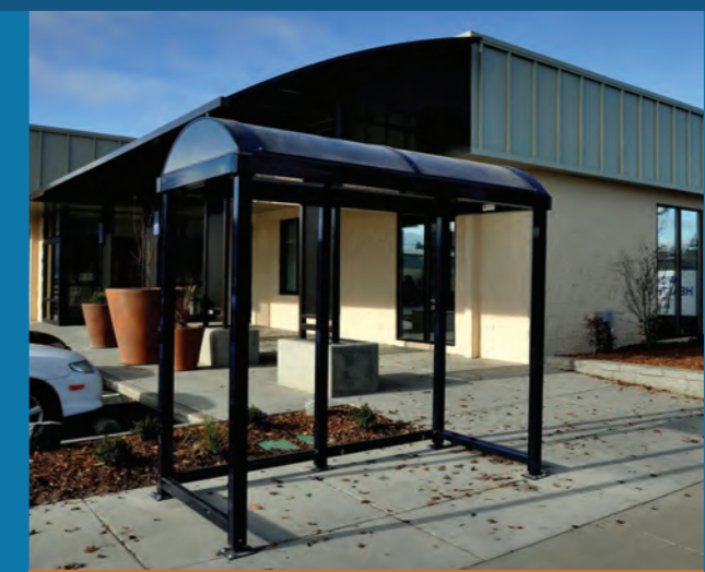
FAMILY AND WOMEN'S HEALTH CENTER

La Clinica received a $250,000 federal grant to remodel the center in 2014 and completed the project early this year. Its staff now includes healthcare providers who are offering primary care services for the whole family. La Clinica's women's specialty services, including all prenatal care, are offered at the center as well.