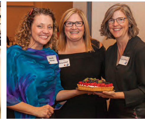
Our annual fundraiser, above, brings in $120,000 for children's programs: Page 3