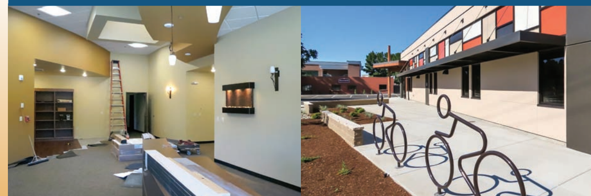
The main lobby of the new center, far left, features a lot of light and a patient library. The building's exterior includes colorful tiles and a spot for bicyclists to store their transport.

Some participants have more than a few projects in mind. At the end of the first session, after groups had presented their visions for ideal systems, one patient stood up and urged the room full of health care and service representatives: "Just remember how much we all want and need this."