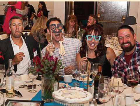
2017 Raise Your Heart for Health

La Clinica is grateful for major contributors to the project including these foundations: Carpenter, Chaney Family, Cow Creek Umpqua Indian, West Family, Gordon Elwood, and Anna May Family.